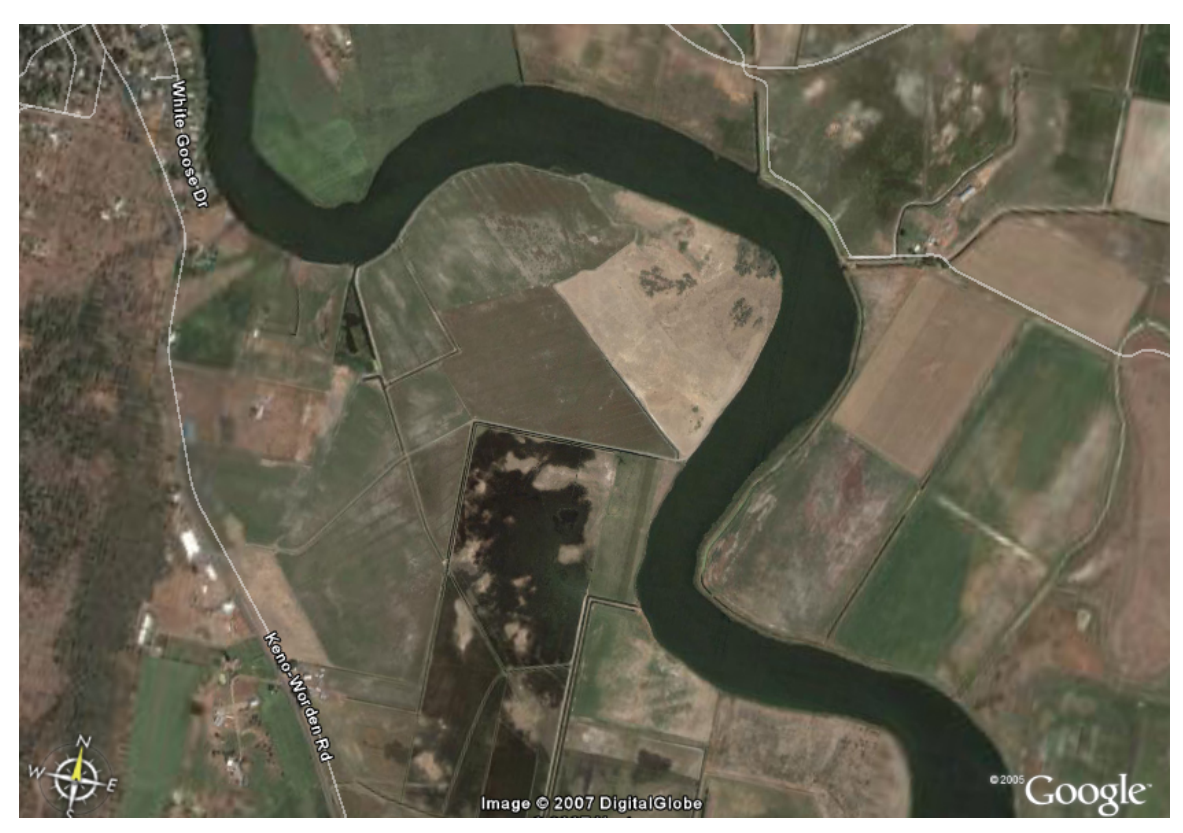
Figure 2. The impounded reach of the Klamath River near the town of Keno, Oregon shows how little functional riparian buffer area remains. Nutrients from farming activities flush directly into the river, promoting nutrient enrichment. Map from Google Earth.

Keno Reservoir is U-shaped in cross-section with a low width-to-depth ratio and only a narrow band of shallow water along its margins. A waterbody with such morphological characteristics would be expected to have low nutrient retention (Dodds and Bernot, 2005; Biggs, 2000; Seitzinger, 2005). The historical channel and connected adjacent wetlands, by comparison, would have exhibited a much higher nutrient retention capability. As noted above, Keno Dam is likely to remain in place, but improvements could be made to the reservoir, such as adding fringing wetlands to increase complexity and nutrient retention.