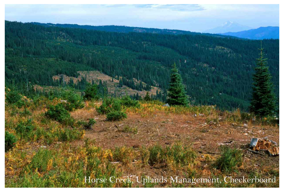
Figure 3. This photo of the Horse Creek watershed shows widespread clear cuts in the transient snow zone that pose high cumulative effects risk.

The U.S.F.S. has recognized high cumulative effects risk in Beaver Creek and Horse Creek because very high rates of timber harvest on private lands within those watersheds (Figure 3).