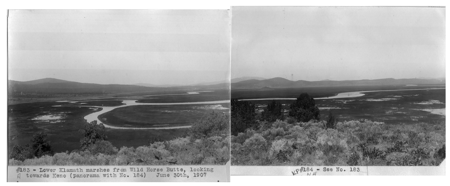
Figure 1. Photographs take on June 30, 1907 by the U.S. Bureau of Reclamation looking west from Wild Horse Butte towards Keno, prior to draining of the wetlands. Wild Horse Butte is a hill approximately one mile southeast of the present-day confluence of the Klamath Straits Drain and the Klamath River. These photographs are part of the Brown Album, a collection of 256 images of the early 1900s Klamath Basin, available online at the Klamath Waters Digital Library website.<sup>1</sup>